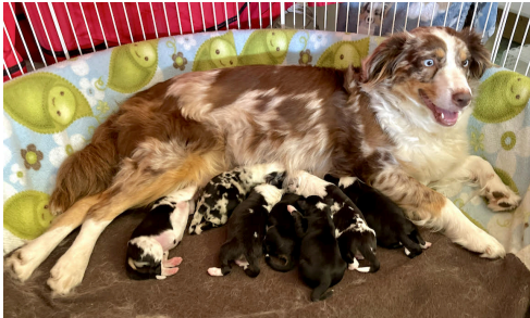
Dam: BLINE'S AWESOME 'PIPER'

*Breeder can only estimate potential adult sizes and are not guaranteed *